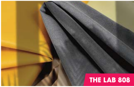
THE LAB 808

+39 031 643 608 info@synt3.com www.synt3.com