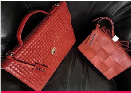
P A FOOTWEAR P LTD., VEGAN DIVISION