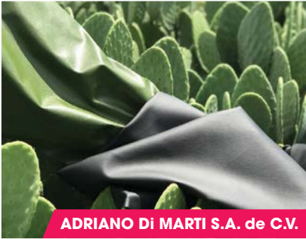
ADRIANO Di MARTI S.A. de C.V.