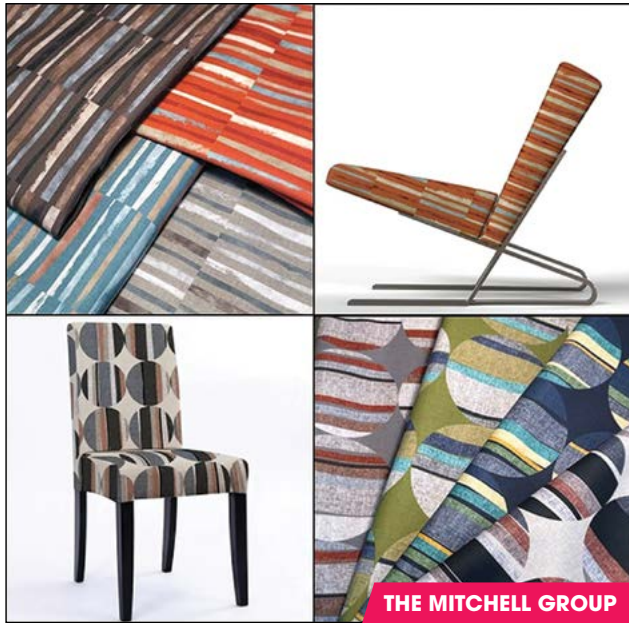
THE MITCHELL GROUP