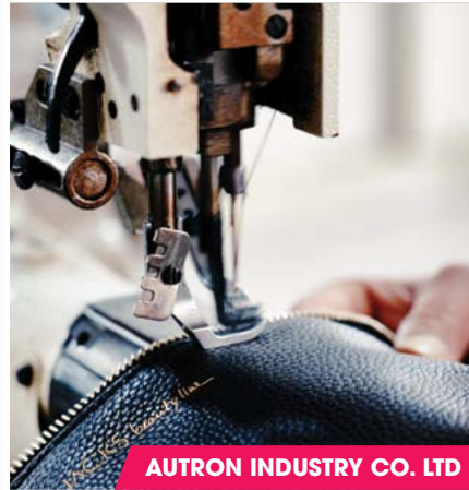
AUTRON INDUSTRY CO. LTD