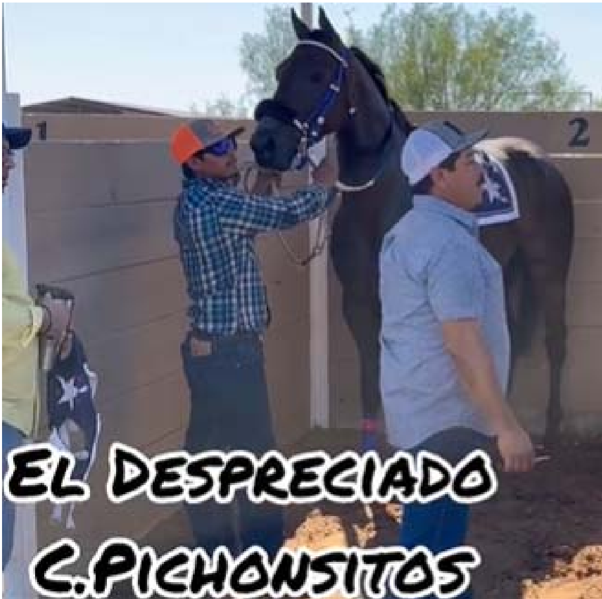
Screenshot from video of a race at El Mezquite Training Center in Laredo, Texas, on 9/9/23, showing a man in plaid (left) handling El Despreciado from C. Pichonsitos prior to racing while man in blue (right) holds a syringe.