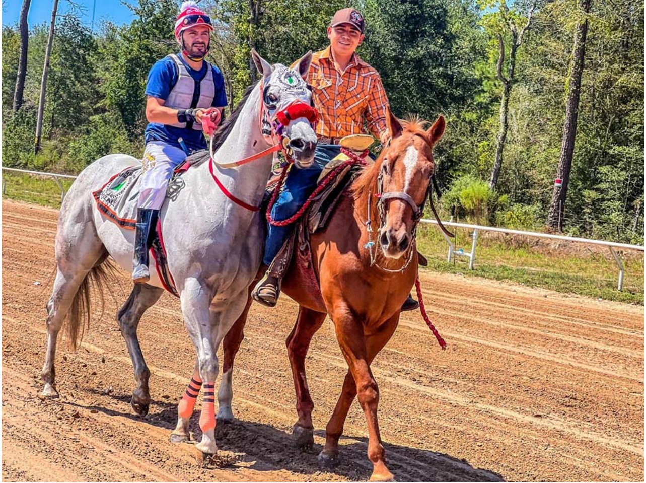
Gray horse with blood on his/her neck at the usual injection site on the track at a race on 9/10/23 at Carril El Coyote in Cleveland, TX.