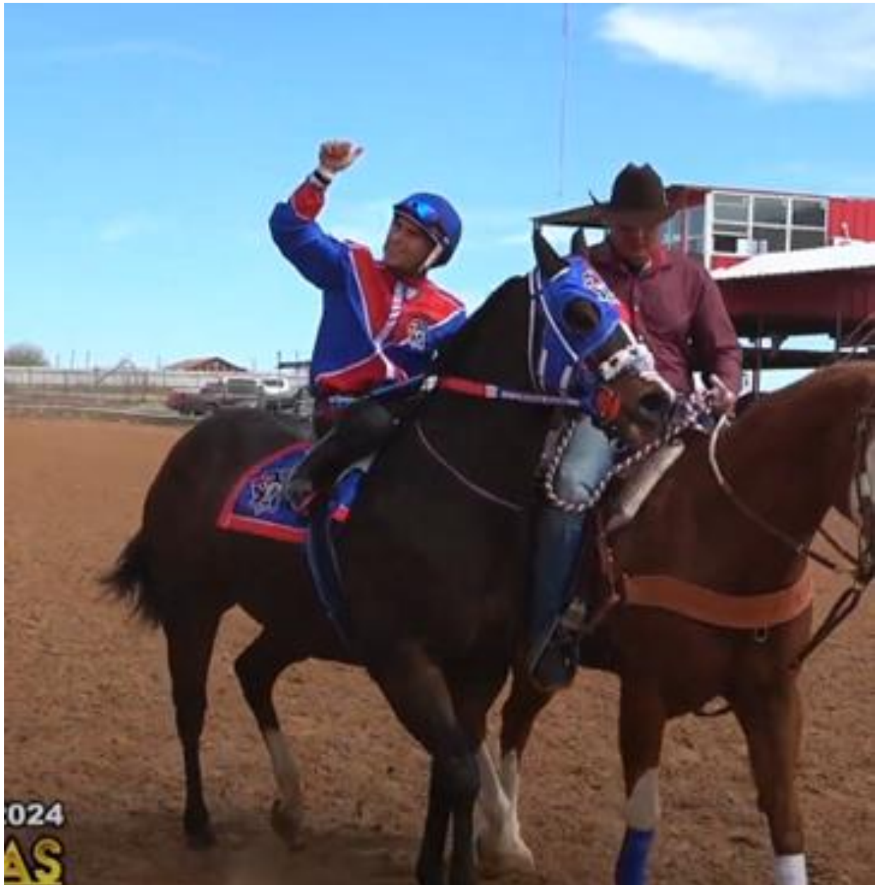
Figure 1. Screenshot from video of a race at 3 Amigos Race Track in Odessa, Texas, on 2/25/24, depicting a jockey (left) with a shocking device adhered to his wrist.

event at La Victoria Training Center show at least three separate jockeys using shocking devices, 30 as seen below in Figures 2 through 4.