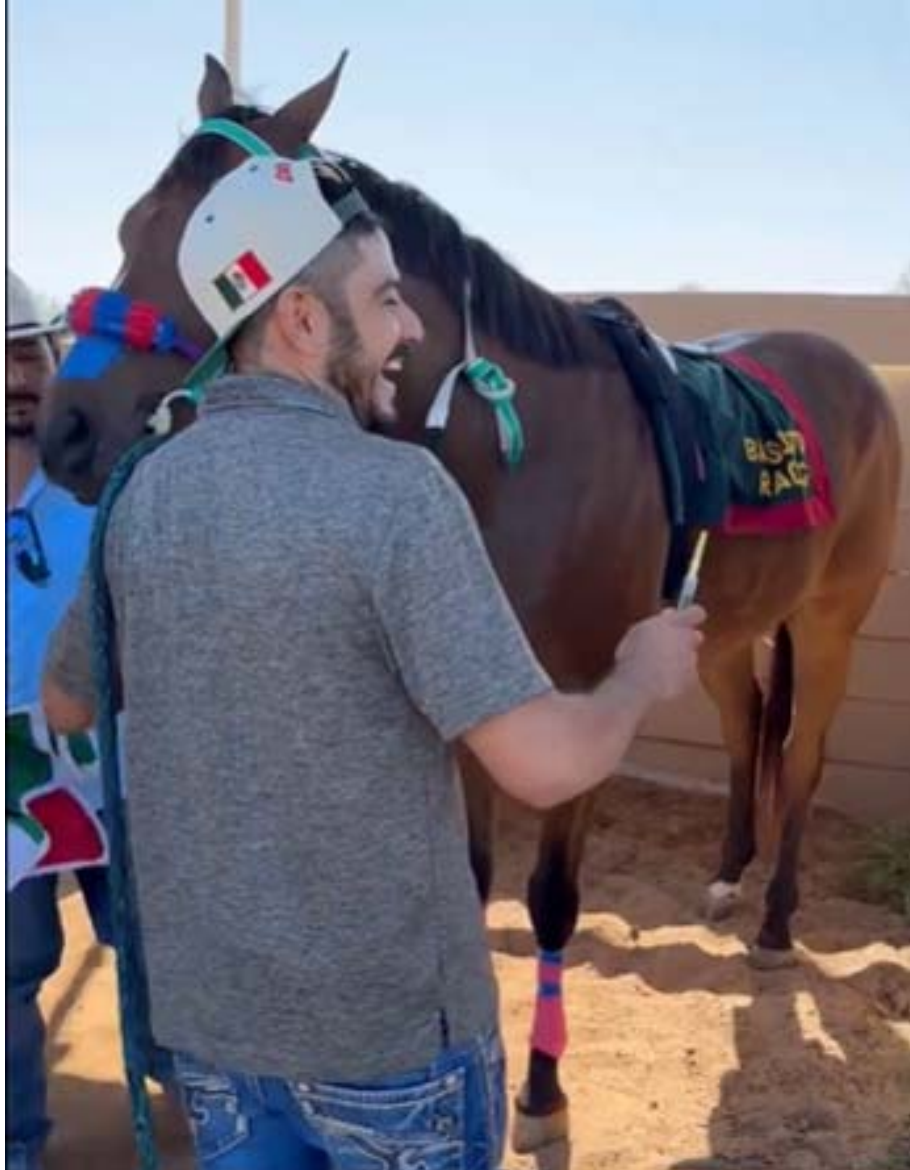
Screenshot from video of a race at El Mezquite Training Center in Laredo, Texas, on 9/9/23 of a man in a grey shirt holding a syringe to inject El Mexicano from C. Basurto Racing.