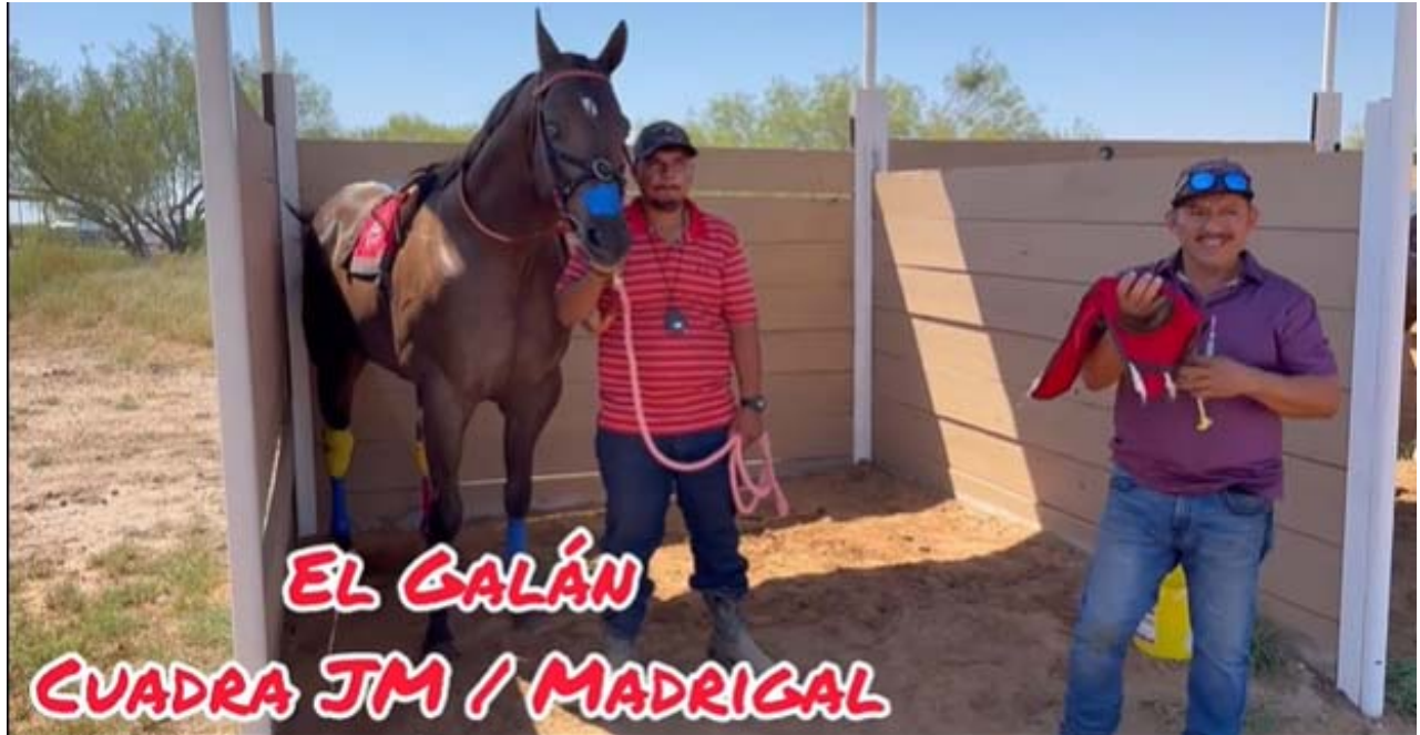
Screenshot from video of a race at El Mezquite Training Center in Laredo, Texas, on 9/9/23, depicting man (right) holding syringes accompanying horse.