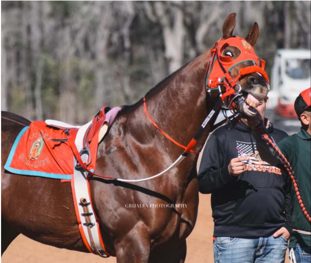
Photograph of man holding syringe on the track at Rancho Los Pinos on 1/28/24, next to a horse used for racing by Cuadra Guadalupe.