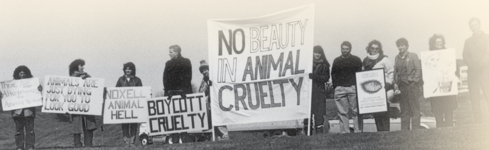
A 1987 PETA protest against animal testing conducted by Noxell, the manufacturer of Noxzema and COVERGIRL, which is now owned by Unilever, a business that's on our list of companies "Working for Regulatory Change"

Johns Hopkins University (JHU) receives more taxpayer money from NIH than any other university and spends it on cruel,