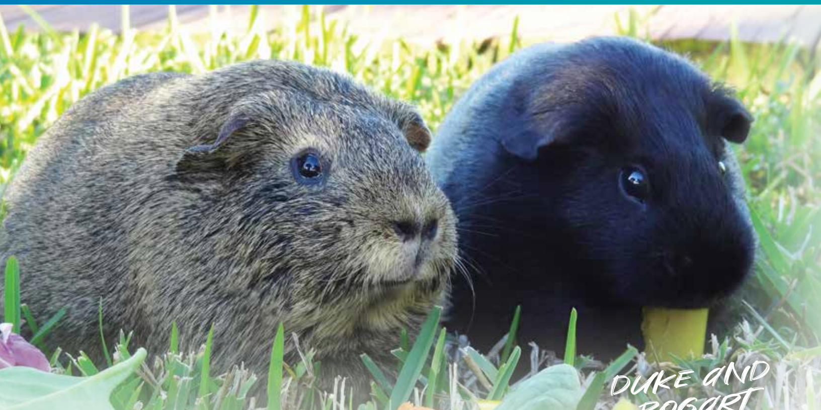
DUKE AND BOGART